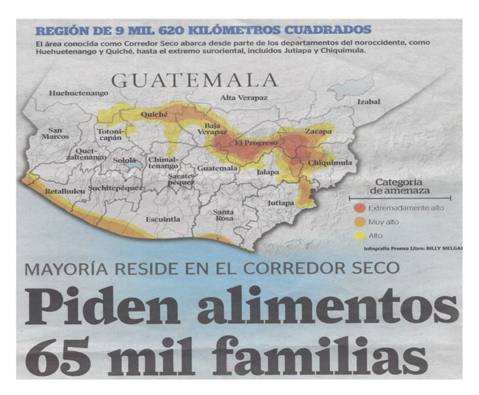
Graphic 30.2 Guatemala: a map of "Dry Corridors and Poor families Affected by Food Security"

extent of these phenomena reaches the general public in the country. The most evident alterations of climatic and environmental factors that mainly affect the population living in poverty and have an impact on nutritional levels in these areas are the following: