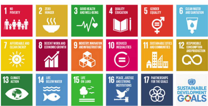
Graphic 30.1 Source UN News Centre (2015), Sustainable development goals kick off with start of new year. http://www.un.org/sustainabledevelopment/blog/2015/12/sustainable-development-goals-kick-off-with-start-of-new-year/. Accessed 28 Jan 2017

office (2015) which he was unable to conclude due to the aforementioned reasons. The press recently voiced concerns in the dissemination of the results obtained during this program according to evaluations held during the period 2012–2015. It is necessary to take into consideration that, although there is a decrease in Guatemalan poverty levels from 59.9% in 2012 to 58.2% in 2013, chronic malnutrition rises to 60.6% in the year 2014 when evaluating children under 5 years of age. However, the current leader of the SESAN recognizes that the program reached only 30% of the residents of the prioritized municipalities (Muñoz Palala 2016). These actions are an example of the implementation difficulties following international agreements.